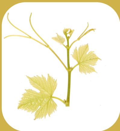
Table grape variety.