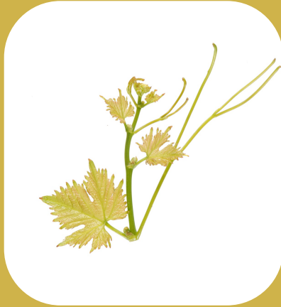
Table grape variety.