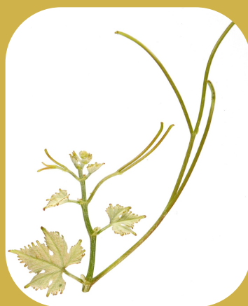
Table grape variety.