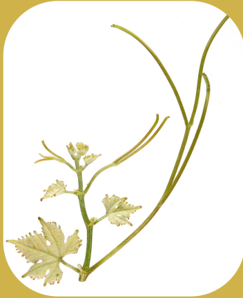
Table grape variety.