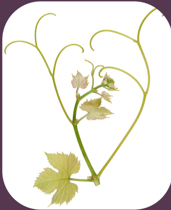
Table grape variety.