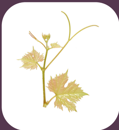
Table grape variety.