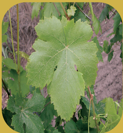
Table grape variety.