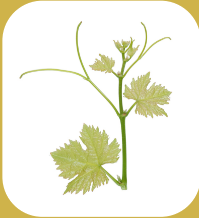
Table grape variety.