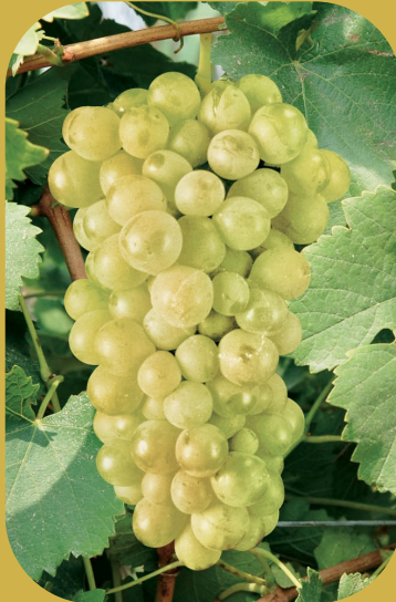
Table grape variety.