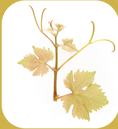
Table grape variety.