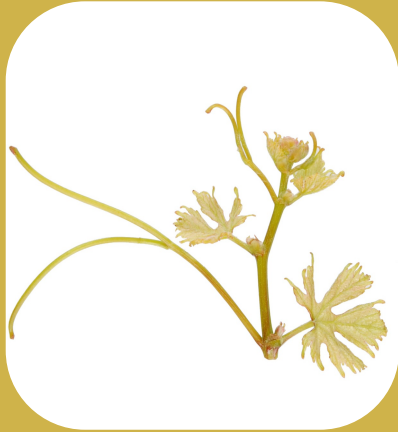
Table grape variety.