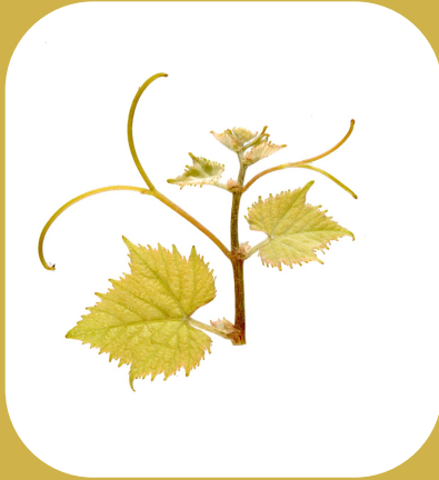
Table grape variety.